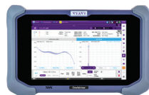
OneAdvisor 800 All-in-One wireline and wireless network installation and maintenance test solution